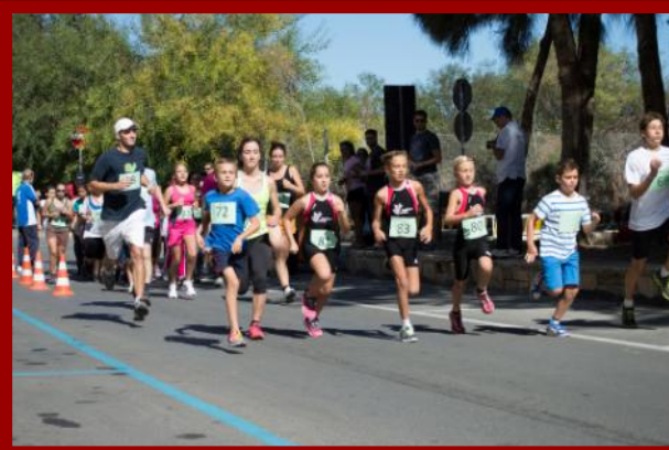
The start of the 2km fun run/walk