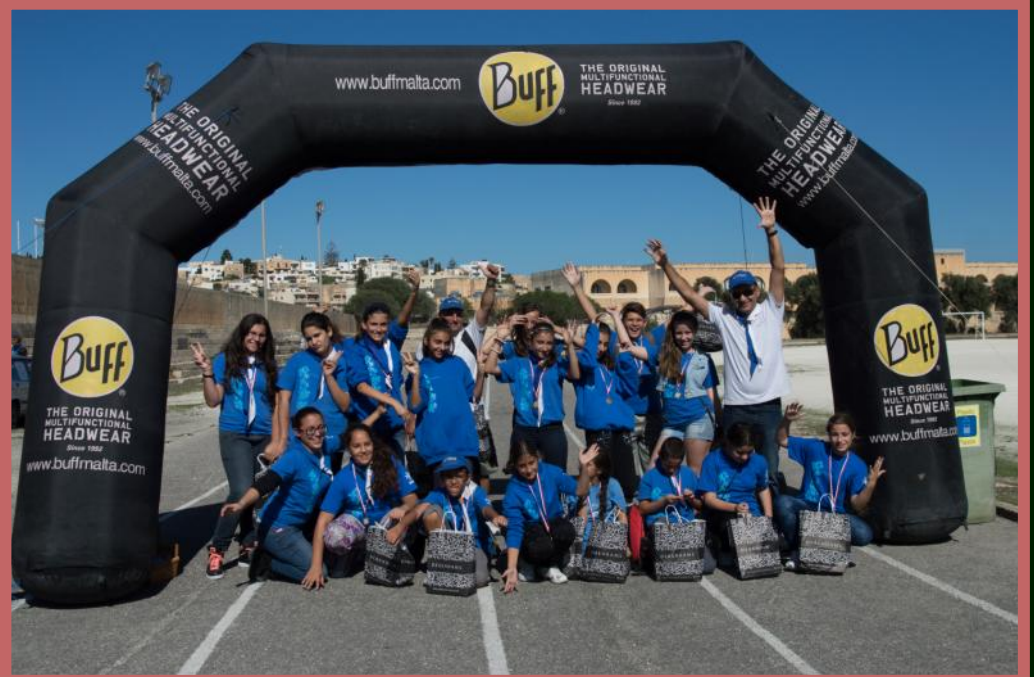
Scouts from the Birkirkara Scout Group who assisted at the event