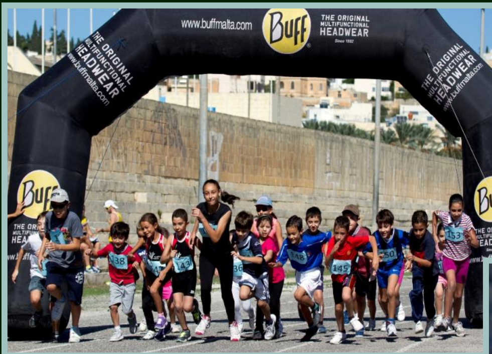
The start of the children's 800m fun run