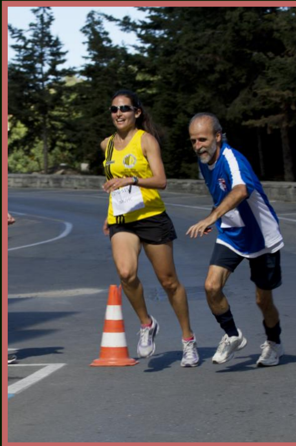
One of the change-overs of the MUHC team in the relay event