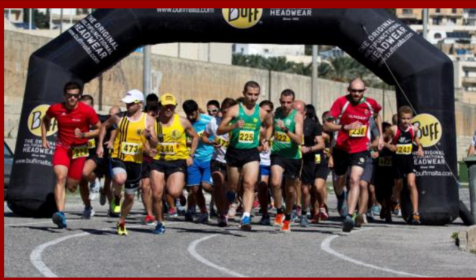
The start of the 5km fun run/walk

The next edition of the University Ring Road Fun Run/Walk & Relay is scheduled to be