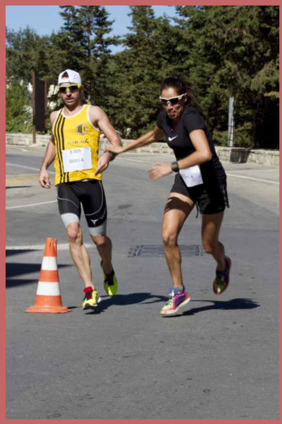
One of the change-overs of the winning team in the relay event