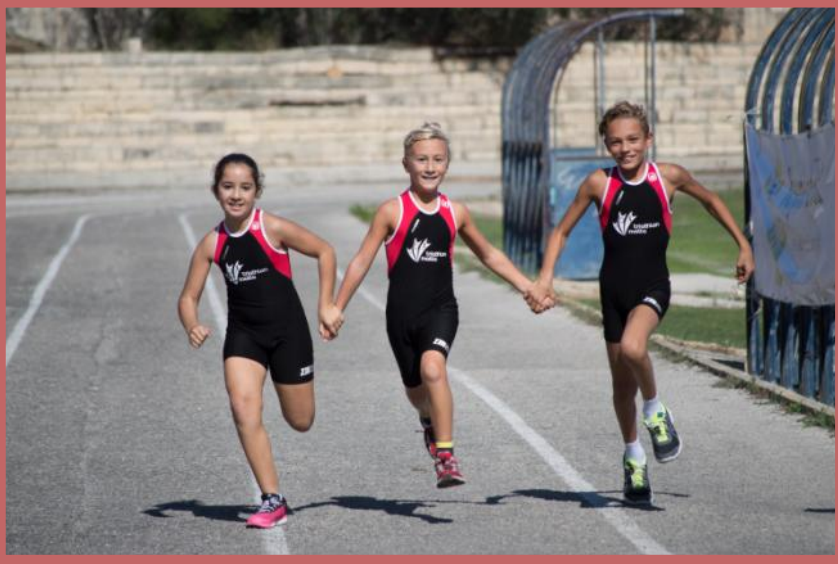
Young triathletes from the Malta Youth Triathlon Academy