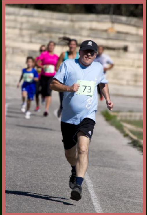
MUHC Group CEO