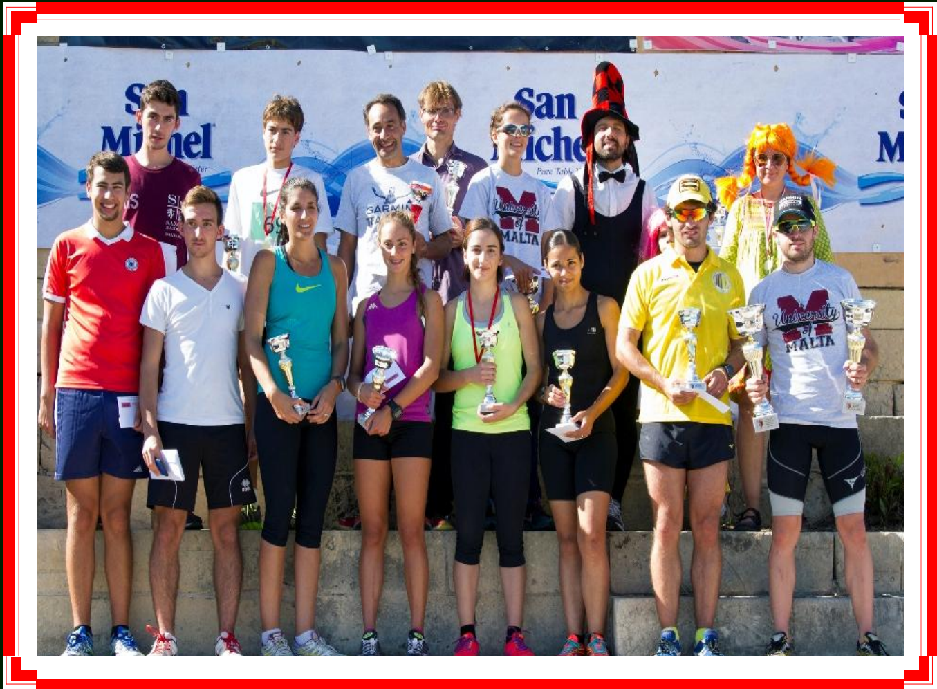
All the award winners