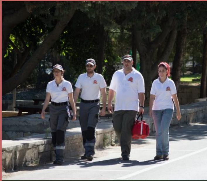
EFRU First Aiders