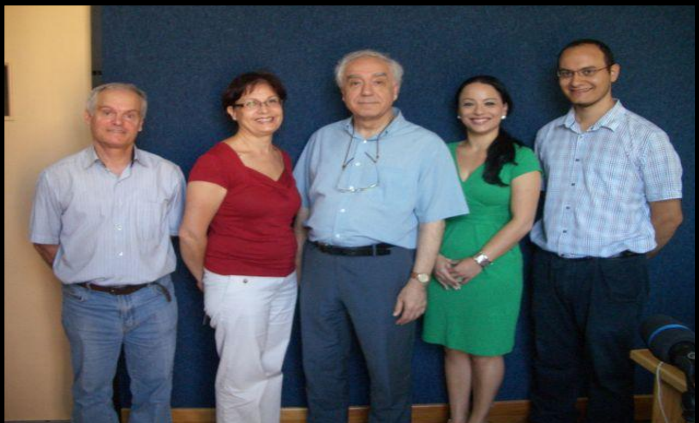
Staff at Campus FM : (from left to right)