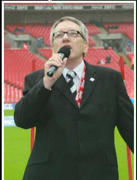
Singing of Oasis hit "Wonderwall" from pitch at Wembley Stadium