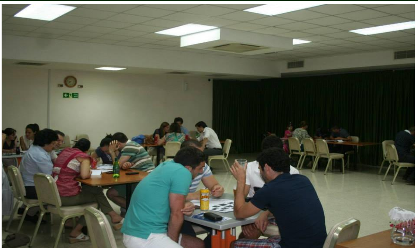
June 2014 Quiz Night - Participants during this event

The second edition of the Uni Quiz Night was held on Wednesday 11 th June 2014 at the Malta University Residence, Lija. Seven teams took part in what turned out to be a competitive and enjoyable evening.