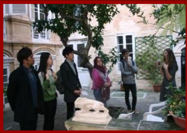
Foreign students enjoying themselves at Casa Rocca Piccola in Valletta