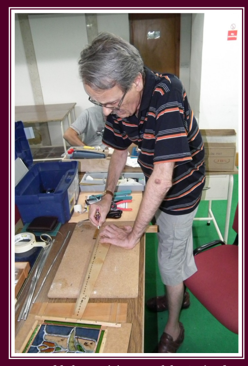
Top and left: Participants of the Stained Glass course busy preparing artefacts