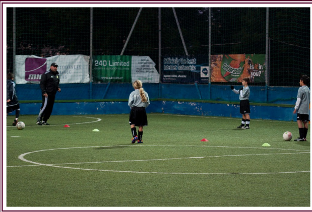
Coerver Football School